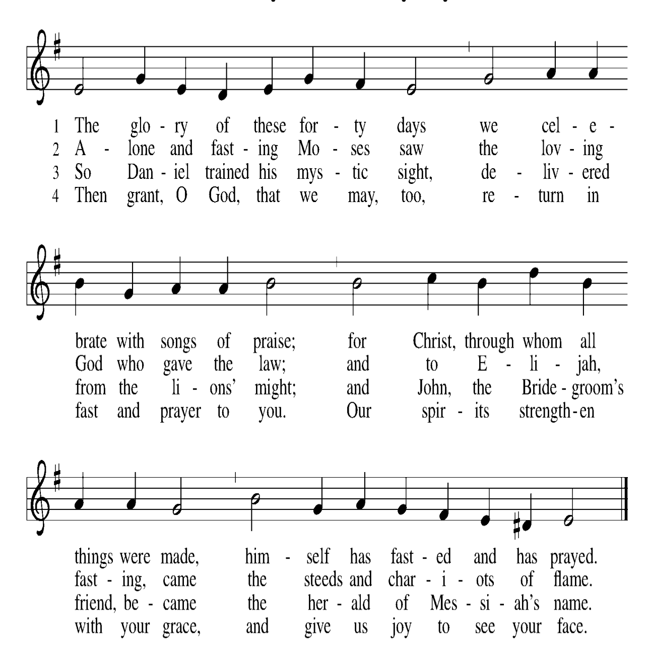
The Glory of These Forty Days