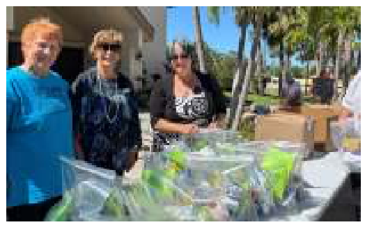
Easter began with a lovely Easter sunrise service celebrated in the courtyard. Special music was provided and beautiful lilies decorated the altar while several members of the congregation enjoyed watching the children in the Easter egg hunt held after the 8:30 a.m. worship service.