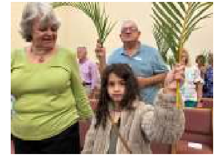
After Palm Sunday service, people stayed to help fill both backpacks for Grace Place and Blessing Bags for the homeless.